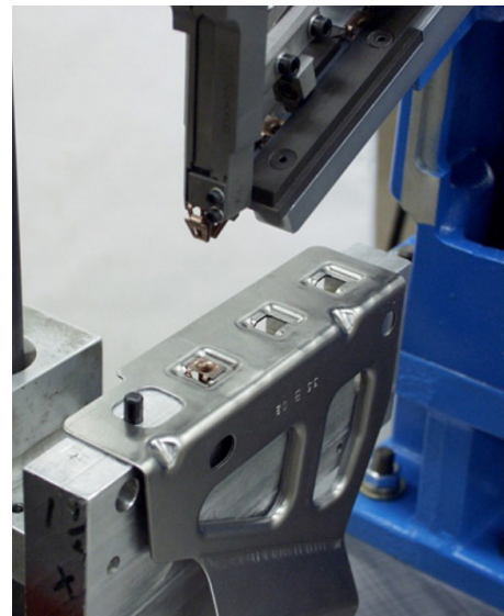
AP-110 Clip Tooling